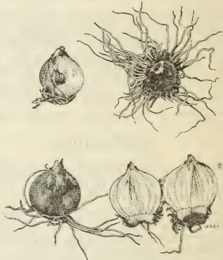
FIG. 3.— Muscari azurea bulbs about 8 years old beginning to show deterioration and no reproduction. Upper right, the base of a bulb which is very large, showing age. Lower right, a bulb split open. The other bulbs are ordinary normal specimens

bed but 3 inches apart. About 100 to 150 seeds covered 1 to 1¼ inches deep are drilled in the row. On Puget Sound all seeding is done under open field conditions, but the preparation of the bed is very thorough. Care should be exercised not to walk on a seeded bed thus planted until the soil has been well settled by rains. If this precaution is not taken the seed stepped on is certain to be pushed down so far that it can not get through the soil when it germinates in the spring.